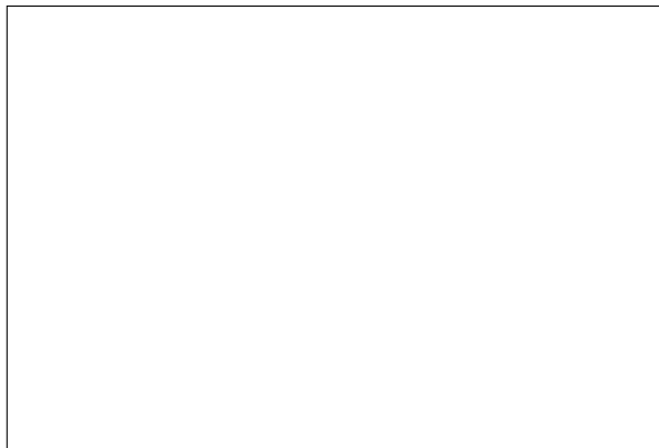
Figure 1. Example of caption. It is set in Roman so that mathematics (always set in Roman: B \sin A = A \sin B ) may be included without an ugly clash.

216 217 218 219 220 221 222 223 224 225 226 227 228 229 230 231 232 233 234 235 236 237 238 239 240 241 242 243 244 245 246 247 248 249 250 251 252 253 254 255 256 257 258 259 260 261 262 263 264 265 266 267 268 269